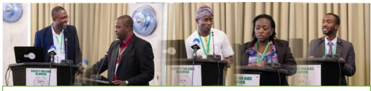
Rapporteurs debriefing after sessions

A team of Rapporteurs was set up in the first week of July with email exchanges to share tools and reporting activities management. Each Rapporteur was allocated a session to cover but it would have been ideal to have at least two (02) Rapporteurs covering the same session. Forms to be filled were provided to Rapporteurs for retrieval of most valuable information. After each theme, Rapporteurs covering the sessions had discussion and main ideas were put together. A matrix of global report was defined according to the content of each theme.